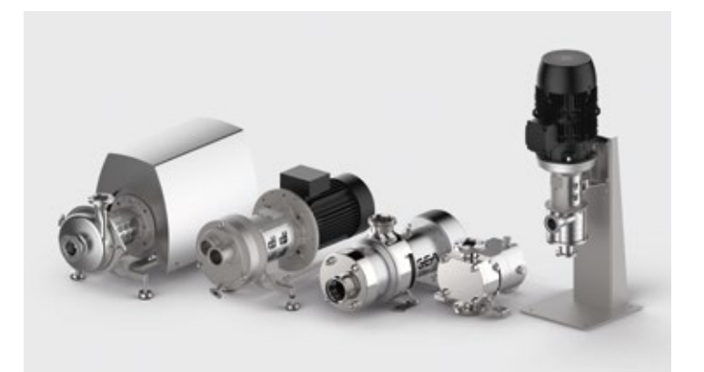
GEA Hilge sterile pumps for pharma

This rotary lobe pump was developed especially for highly viscous media and for applications requiring gentle transfer. With its vertical connections, the pump is completely drainable and meets the EHEDG requirements. It is available with a double-sealed, aseptic front cover, which provides better protection against the penetration of bacteria.