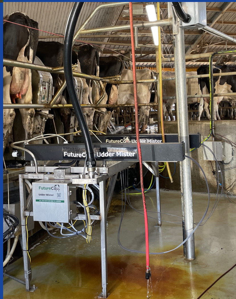
Udder Mister 2.0: For rotaries turning less than 7 seconds per stall.

Contact your local GEA dealer to learn more about Udder Mister and see if it is a solution for your dairy.