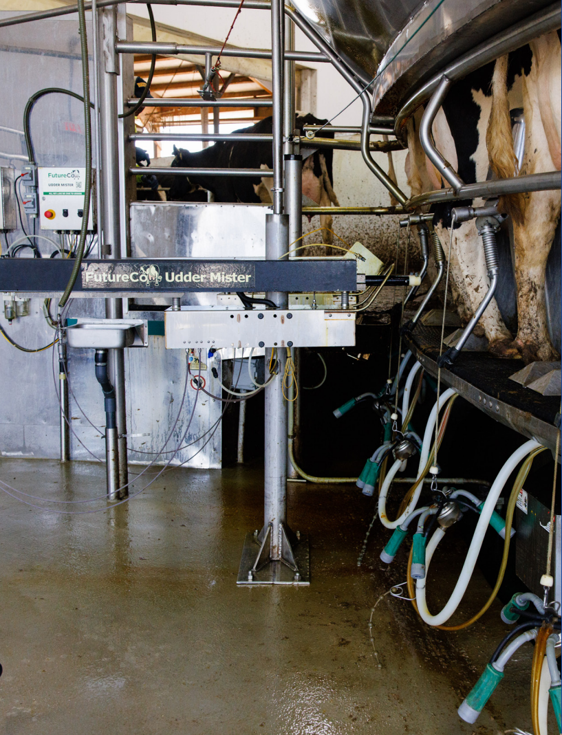
Udder Mister 1.0: For rotaries turning 7 seconds or more per stall.

Contact your local GEA dealer to learn more about Udder Mister and see if it is a solution for your dairy.