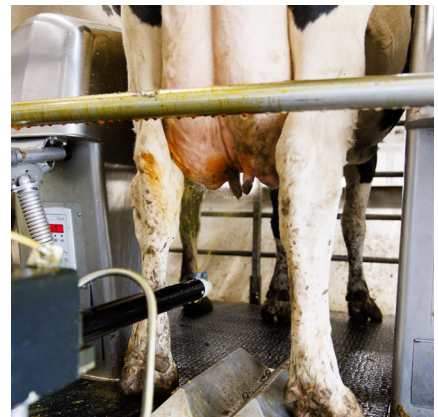
Many GEA teat dip options are compatible with this system.